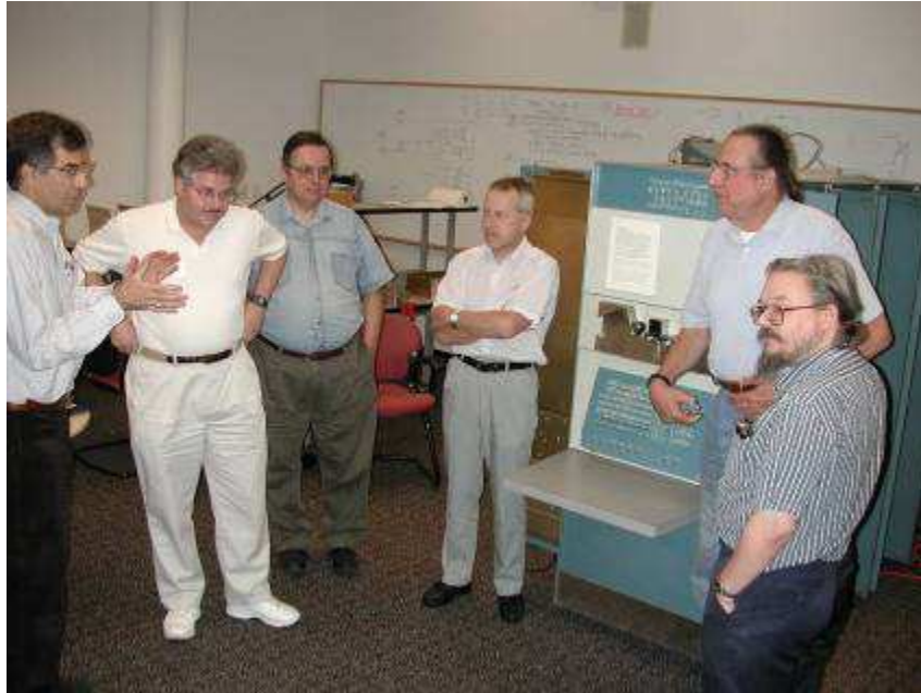
PDP-1 Restoration Team