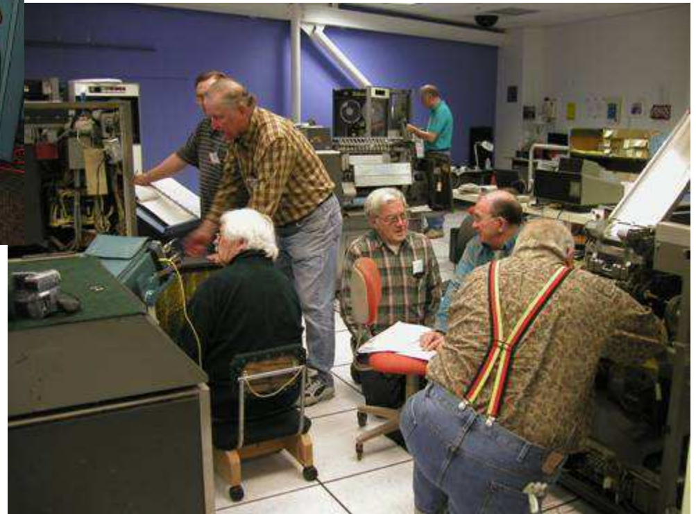
IBM 1401 Team