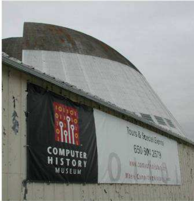
Moffett Field, CA