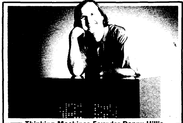
— Thinking Machines Founder Danny Hillis —

One of the best indicators that the customers are getting good results is that most of them have followed up their initial purchases with additional orders for Connection Machines. The fact is, contrary to Bell's continuing prediction, massive parallelism works. Connection Machines and other massively parallel computers routinely achieve significantly higher performance than vector computers at a